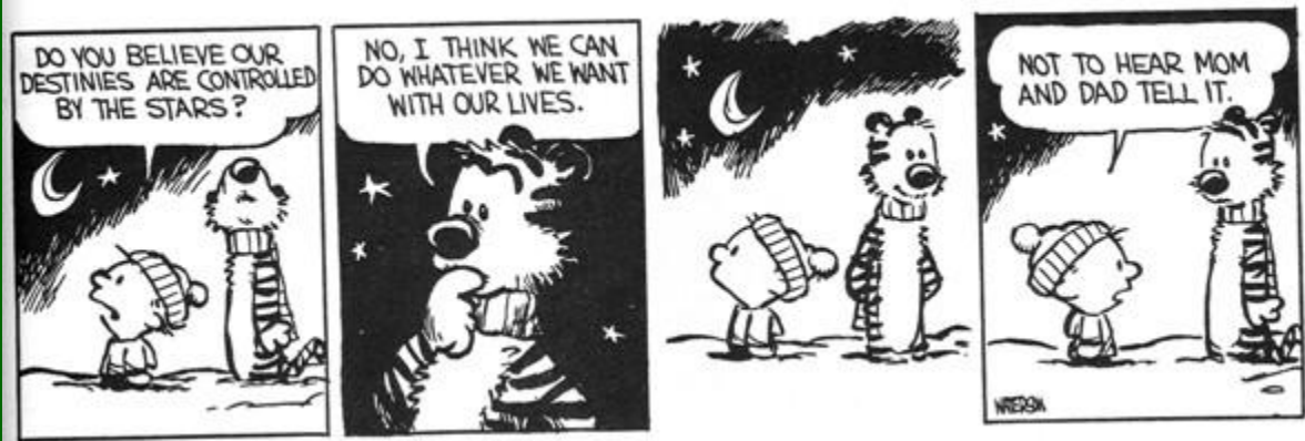
Calvin and Hobbes by Bill Watterson

To make a voluntary contribution in support of this newsletter, please click here. And thank you!